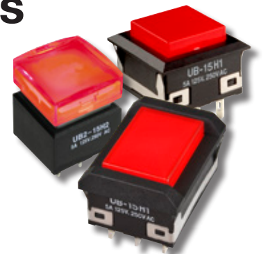
UB & UB2 Series with Bright Red LEDs will Undergo Changes

The Bright Red LEDs for UB and UB2 Series illuminated pushbuttons and indicators will be changing. Both standard and custom pushbuttons and indicators are included in the revision. The change will effect electrical specifications, which are compared below with the new specifications. Part numbers for effected standard switches and indicators are shown on the following page.