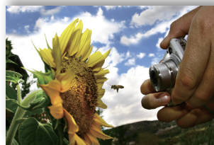
2 Digital Camera