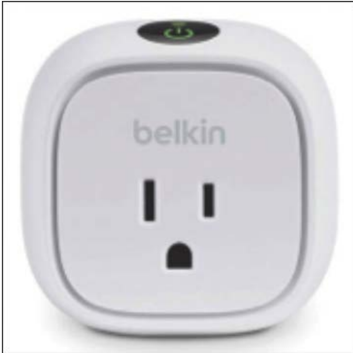
Figure 3. The Belkin WeMo Insight Switch allows you to turn devices on or off, program customized notifications, and change device status—from anywhere.

A newer example of a consumer-driven IoT is smart parking systems. Pilot projects underway across the U.S. use a network of sensors to detect open parking spaces in dense urban areas. This data is then shared with your mobile device, and an application can navigate you to the best parking option. Certainly there is a commercial aspect to this deployment of sensors, because it could essentially act as "advertising" for parking spaces and potentially increase the utilization of lots implementing this technology. But the real resource managed here (and the reason we would be willing to pay for this service) is time. This IoT parking system would significantly reduce the time it takes to park in downtown Los Angeles, Chicago, New York, or any other bustling metropolis.