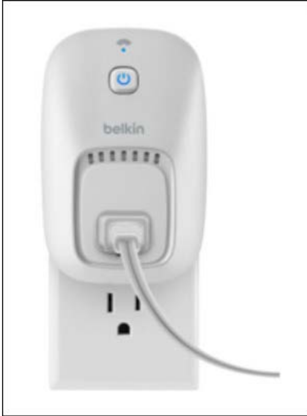
Figure 2. The Belkin WeMo Switch wall unit. Provides wireless control of TVs, lamps, stereos, heaters, fans, and more. This smart switch features the energy-metering technology in the 78M6610+LMU from Maxim Integrated. 7